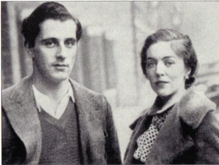
Elusive Rothschild, The Life of Victor, Third Baron

Which is more plausible? One of the richest men in the world, Victor Rothschild espoused Communist ideals so that his own fabulous wealth and position could be taken away?