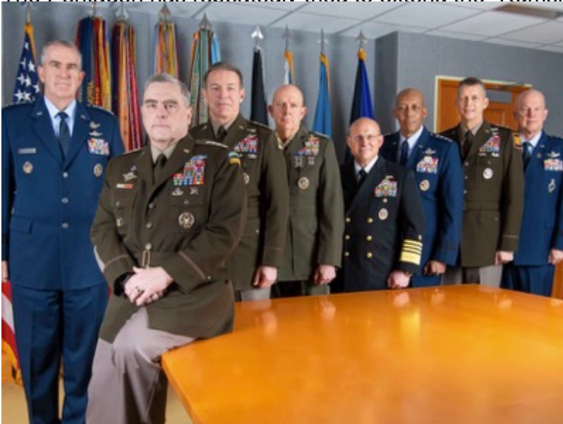
The eight members of the Joint Chiefs of

The Pentagon has repeatedly tried to extend the "Rumsfeld/Cebrowski doctrine" to the Caribbean to regime, but of the Bolivarian Republic of