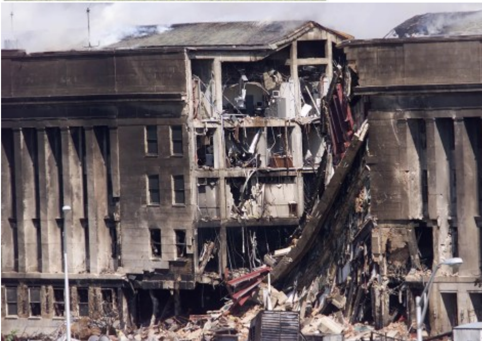
Smoke billows from the Pentagon on September 11, 2001.