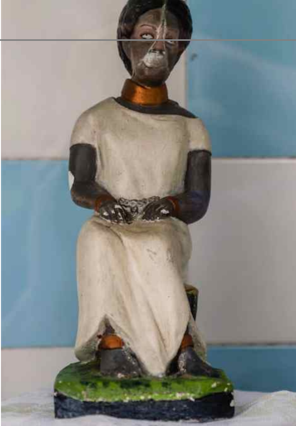
Effigy of Anastasia in her unofficial altar outside of the Church Our Lady of the Rosary of Black People in Salvador da Bahia, Brazil.

Detractors of this equivalence I am making between the mechanisms of chattel slavery and the covid restrictions on civil liberties will point to the specificities of each system of domination and rely on the inexactness inherent in analogies to make their case. Anticipating such arguments, I will stress that slavery takes many different shapes in different spatial and temporal contexts.