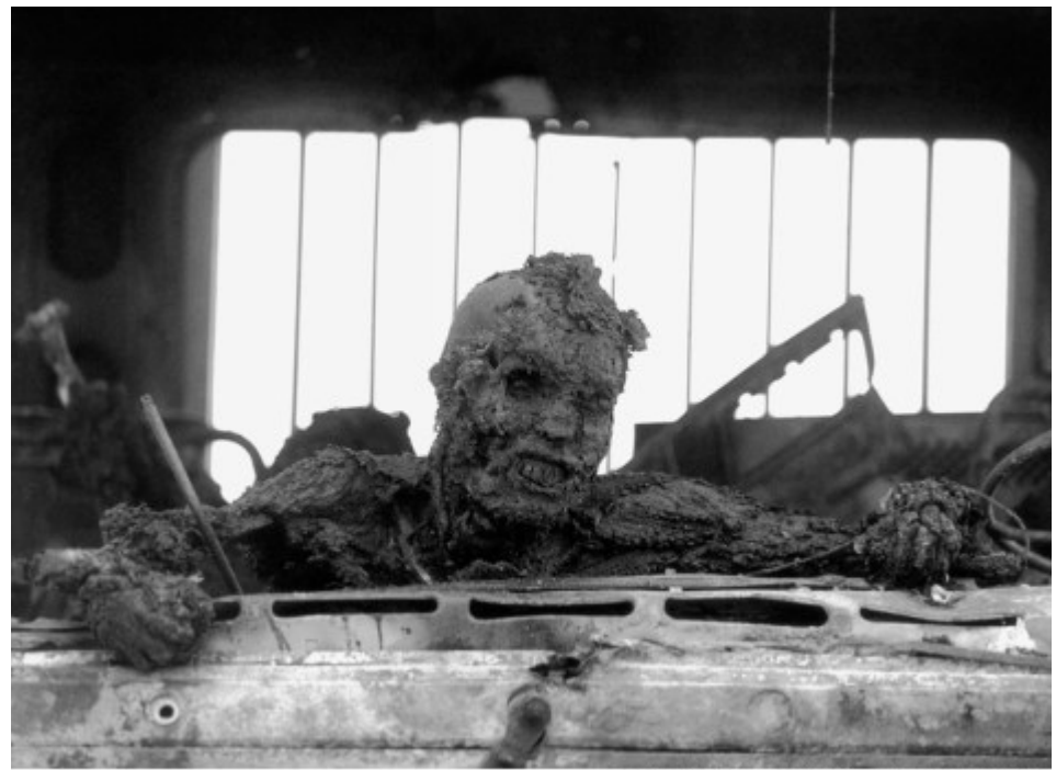
1992

The Western media were all largely onside from the beginning, refusing to publish any information or photos to detract from America's sanitised 'Bambi' war where nobody suffered. The non-Western media looked at Al Jazeera and reformed their editorial policies in favor of survival. Those foreign reporters still alive, had come to their senses and stopped reporting unpleasant news. The Iraqi institutions also learned their lessons, and the UN was then no longer offside but happy to claim DU was as healthy as vitamins. The lessons were clearly understood by all: if you report the wrong things, we will kill you. And, there we are. A total news embargo which is still in force today and under the same rules.