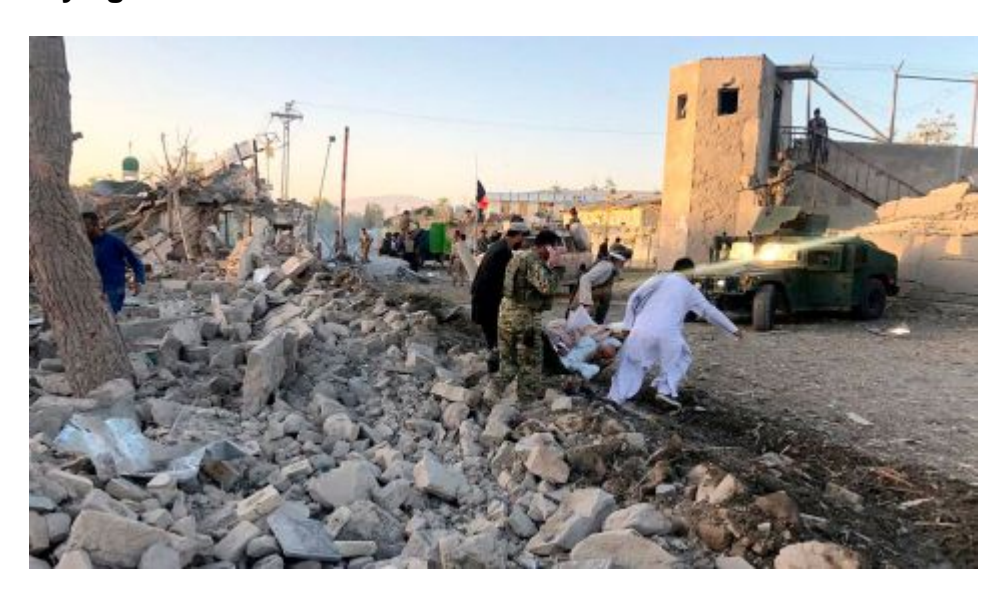
The BBC ran a story titled, "US strikes raze Falluja hospital",[21]