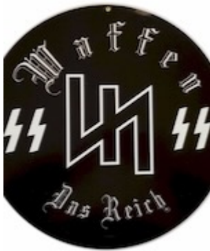
SS Division Das Reich

In Washington, Presidents Truman and then Eisenhower decided to focus on psychological warfare against the Soviets. The CIA created AmComLib (American Committee for the Liberation of the Peoples of the USSR), which operated Radio Liberty from Munich. It recycled Gerhard von Mende. It was he who proposed the establishment of a mosque in Munich, which was eventually entrusted to Said Ramadan (the son-in-law of the founder of the Brotherhood Hassan el-Banna) [5]. It was also he who settled Stepan Bandera’s problems and recycled him to MI6 and the CIA [6].