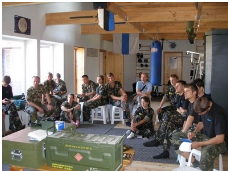
Young Ukrainians, members of the OUN-B (i.e. the Organization of Ukrainian Nationalists with a Banderite tendency), are taking sabotage courses at a NATO base in Estonia (2006). The training ended with a tribute to German, Estonian and Finnish soldiers who died for the Third Reich.

“persecuted” by Arab dictatorships. At least 17 allied states participated in “Operation Timber Sycamore”, supplying billions of dollars worth of weapons to the jihadists [13] until they threatened the West. Let’s be careful not to repeat the same mistakes!