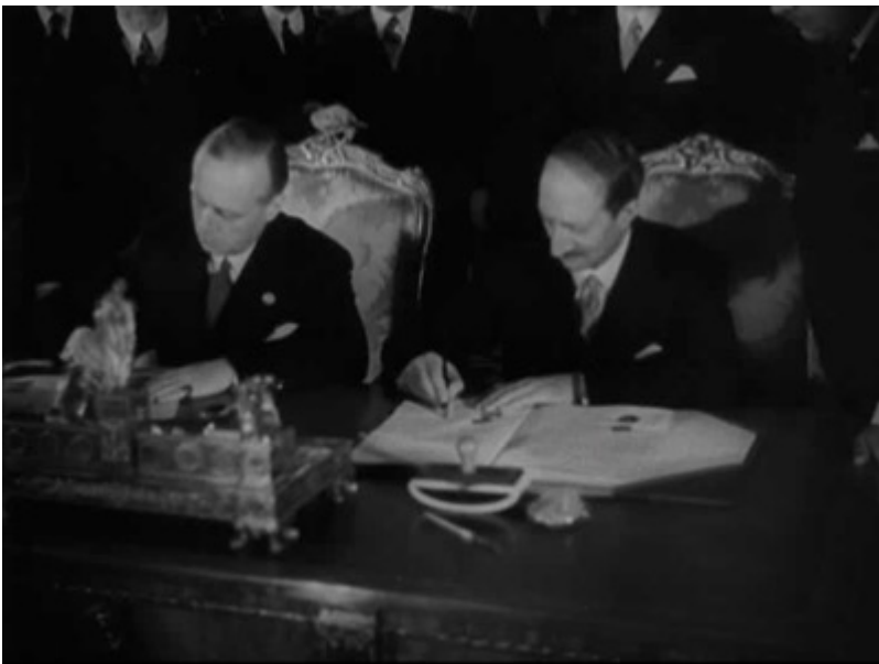
Joachim Ribbentrop and Georges Bonnet sign the Franco-German Commitment to peaceful collaboration (1938).