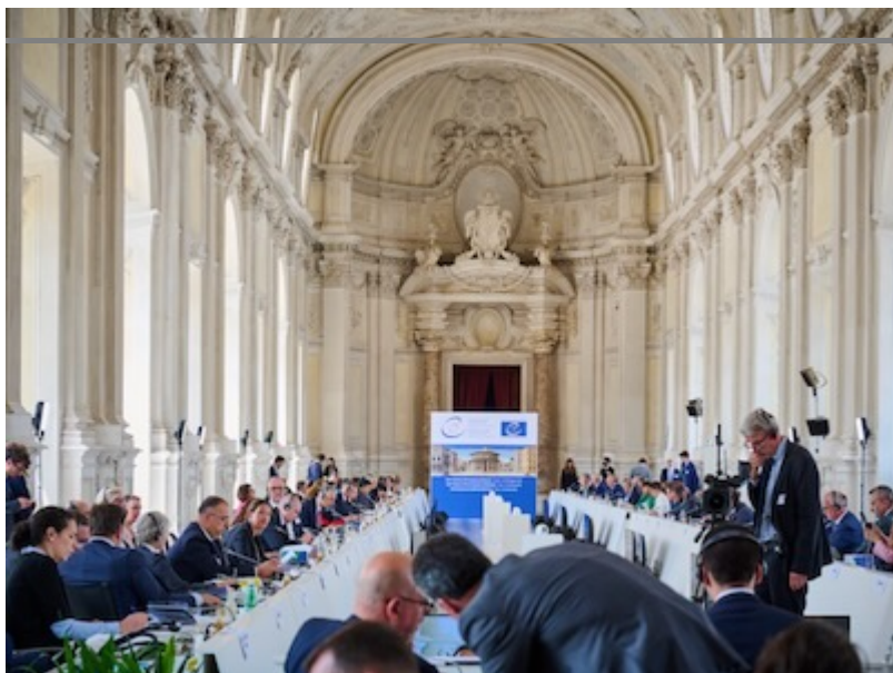
The last meeting of the Committee of

Ministers of the Council of Europe, without the participation of Russia.