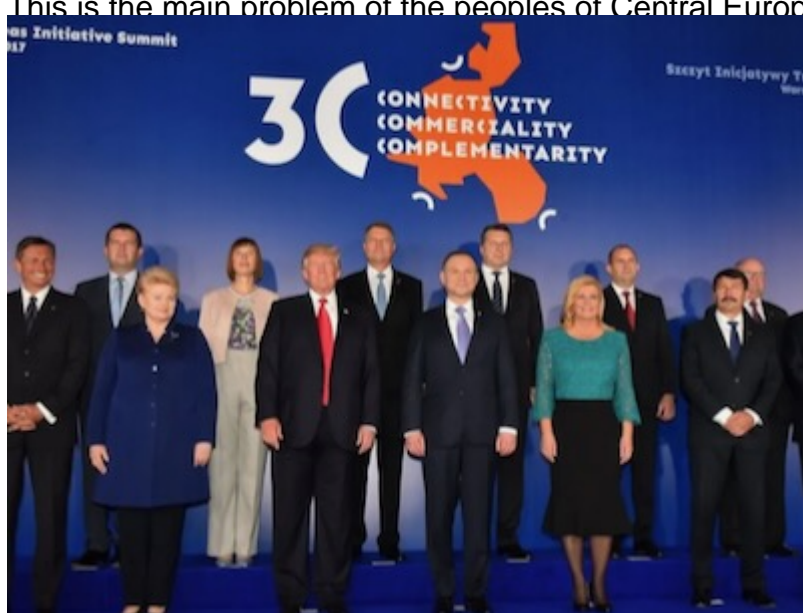
In 2017, U.S. President Donald Trump

This is the main problem of the peoples of Central Europe: they rightly seek to assert themselves but they are unable to do so without fighting them to confront each other.