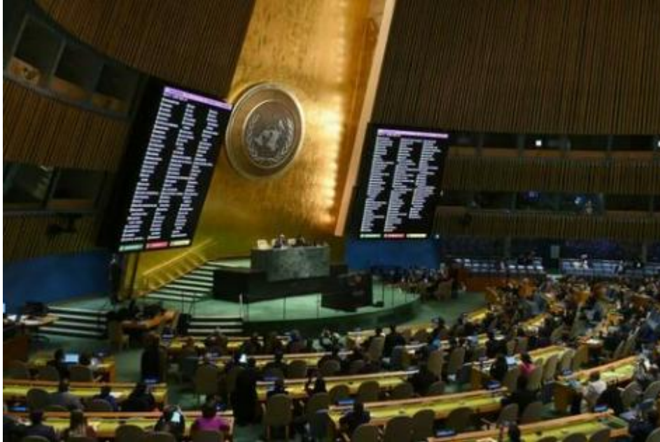
A general view shows a screen of votes during a United Nations General Assembly meeting to vote on a non-binding resolution demanding "an immediate humanitarian ceasefire" in Gaza at UN headquarters in New York on Dec. 12, 2023.

"So, they resent that they're not well received in the marketplace. And historically, they've embraced the state because it provides them with an income and a gratifying grand title if they're working for some big government agency or forum: for the U.N., or an NGO, or for NOAA, or whatever."