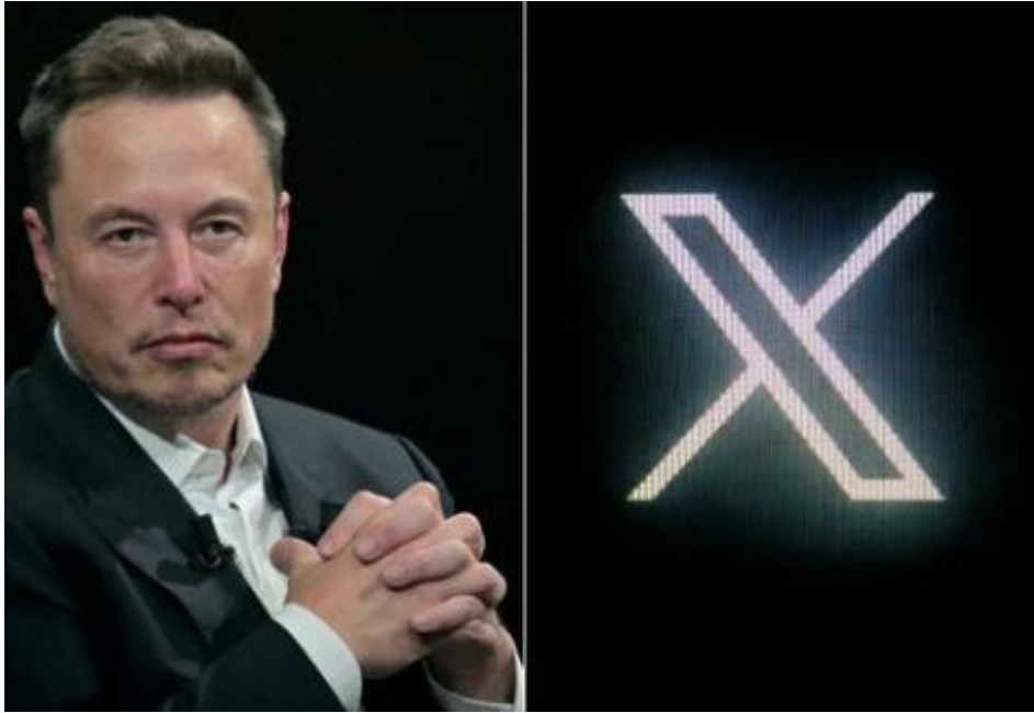
(Left) SpaceX, Twitter, and Tesla CEO Elon Musk is seen during his visit at an event in Paris, on June 16, 2023. (Right) The new Twitter logo rebranded as X, pictured on a screen in Paris on July 24, 2023.