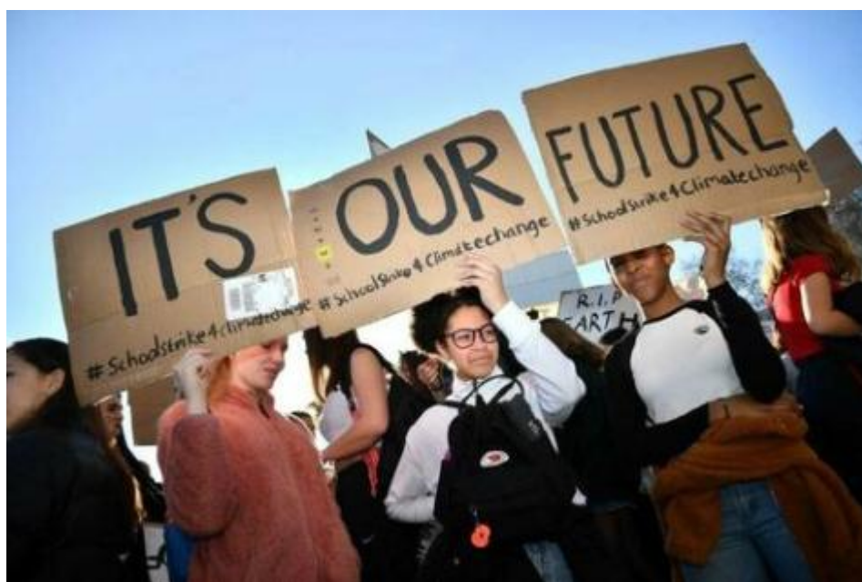
Young demonstrators hold placards as they attend a climate change protest opposite the Houses of Parliament in central London on Feb. 15, 2019.