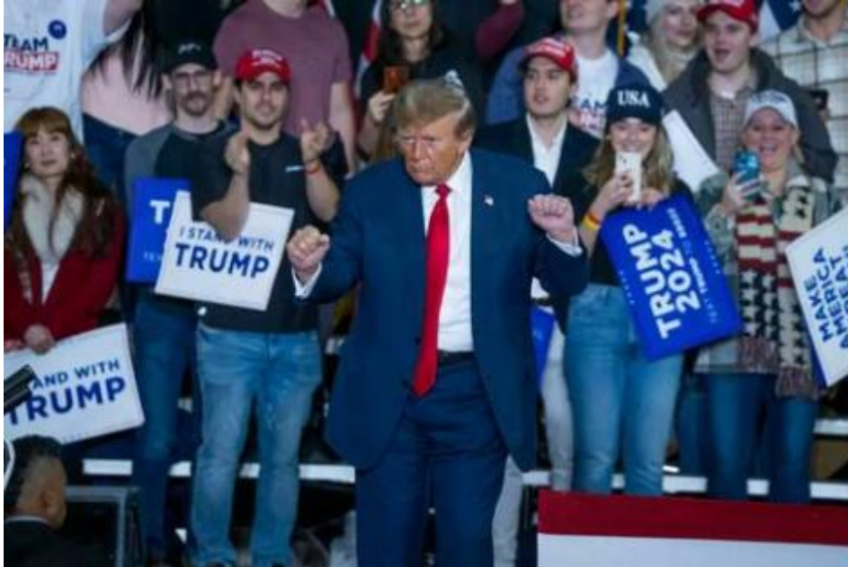
Republican presidential candidate and former President Donald J. Trump dances after speaking at a rally in Manchester, N.H., on Jan. 20, 2024.

thing, to think that public backing for the arts, is a good thing, and so on and so forth. And when you come out and say that you don't think the climate thing is true, you're not just making a narrow point about the medieval warm period, or the geological record, on temperature, you're saying something much bigger, ideologically.