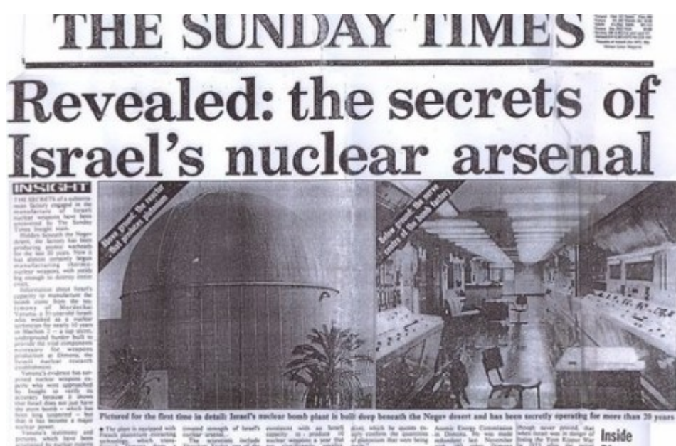
Mordechai Vanunu's revelations on the front page of the Sunday Times.

During the October 1973 war (known in the West as the “Yom Kippur War”), the Defense Minister, the Ukrainian-born Israeli Moshe Dayan, and the Prime Minister, the Ukrainian Golda Meir, again considered the use of 13 atomic bombs [6].